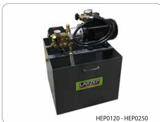
HEP0120 - HEP0250