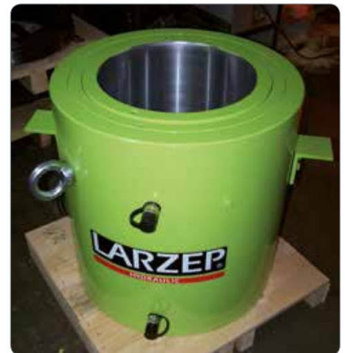
DDR200015 cylinder. 2.000 Tn capacity cylinder for electronic load cell for pile testing.

Pressure gauge separated from the load cell with a 0,8 metre hose AP2008.