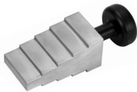
Aluminium Safety Block CY15B as option.