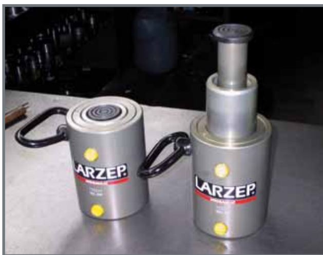
Telescopic Aluminium Cylinders, DLA.