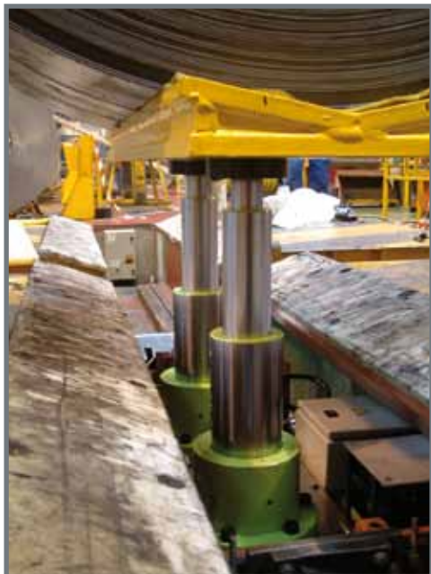
Double Acting Telescopic Cylinder, DLA.