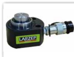
Low Height Single Acting Telescopic Cylinders, SLX.